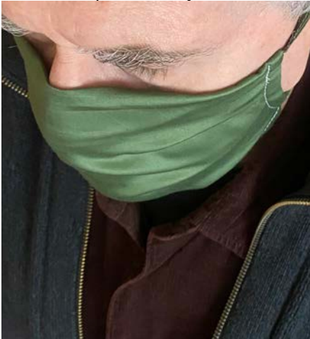
Man: fold up with no eyewear

⇒ The seal between the mask and the face in the orbits of the eyes and around the nose is poor: not ideal .