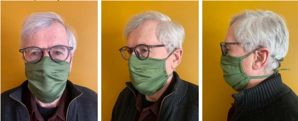
Man: fold up with eyewear

⇒ Eyewear helps to provide a good seal between the mask and the face in the orbits of the eyes and around the nose: if there is no fogging in your lenses, this is good .