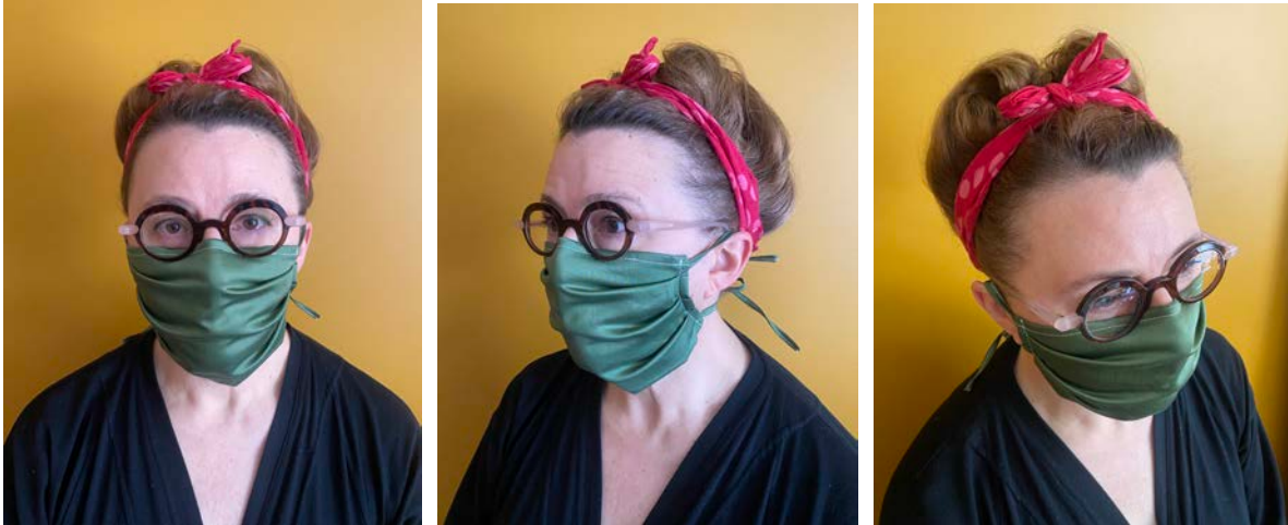
Woman: fold down with wire and eyewear

⇒ Eyewear may or may not fit over wire to provide a good seal between the mask and the face in the orbits of the eyes and around the nose: if the glasses sit where they should and if there is no fogging in your lenses, this is good . Do you have older glasses you may try? If not, decide between Option 1 (fold up) and Option 2 (fold down): which works best for you?