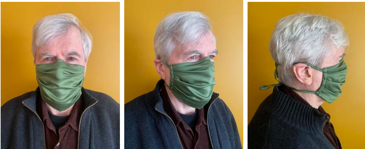
Man: fold down with wire and no eyewear

⇒ Eyewear may or may not fit over wire to provide a good seal between the mask and the face in the orbits of the eyes and around the nose: if the glasses sit where they should and if there is no fogging in your lenses, this is good . Do you have older glasses you may try? If not, decide between Option 1 (fold up) and Option 2 (fold down): which works best for you?