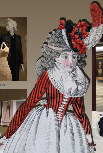
Detail of Journal de la mode et du goût , 1791 Collection of the Palais Galliera, Paris