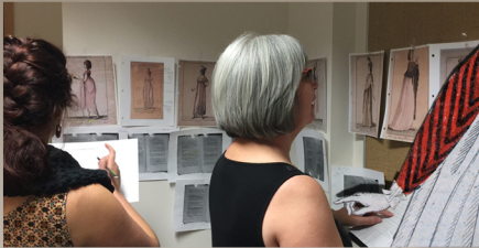
1790s SSHRC fashion plate research