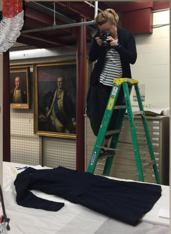
Washington's coat in the SSHRC study